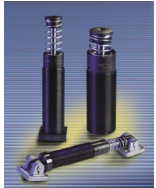
ACE MAGNUM Industrial Shock Absorbers

For a good 40 years, ACE has been convincing customers with well thought out solutions and valuable innovations revolving around industrial shock absorbers. These products are widely used in future-oriented companies since there is no better solution to decelerate moving objects in production or transportation. Shock absorbers provide for the smallest amount of braking force and shortest stopping time because, unlike other methods of energy absorption, they stop moving masses with constant linear deceleration. You benefit from: more compact constructions, faster production processes, increased operating lifetime, safer equipment, reduced maintenance costs, less energy expenses, lower noise pollution.